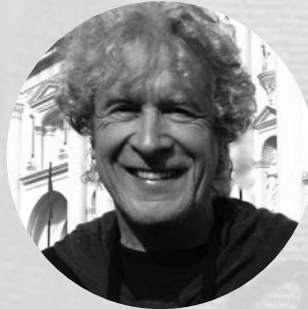
John Perkins Economist, Author, Activist