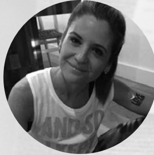
Glenn Doyle Melton Author, Blogger - Momastery